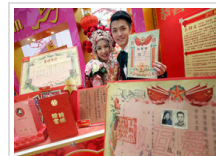
Be my Valentine