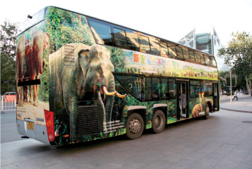
Top: Winners of holiday packages to Sri Lanka collect their prizes at The Place mall in Beijing. The competition was part of a shopping mall campaign by the Sri Lanka Tourism Promotion Bureau and Chinese partners. Above: Campaigns to boost Sri Lanka tourism in China last year included the branding of buses in major cities.

With its golden beaches, towering mountains, ancient monuments and stunning wildlife all enclosed in a compact island, Sri Lanka is pretty much the perfect holiday destination. But 30 years of conflict between the government and Tamil separatists put many tourists off.