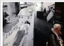
HK: Homeless plight

| About Us | Services & Products | Advertise on Site | Contact Us | Subscriptions |