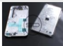
Again, the iPhone 6 photos come from China, could