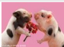
Animal kingdom feeling the coming Valentine's Day